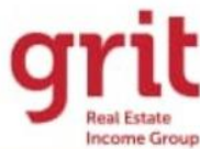
Gateway Real Estate Africa