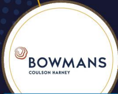
Coulson Harney Advocates