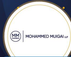
Mohammed Muigai LLP